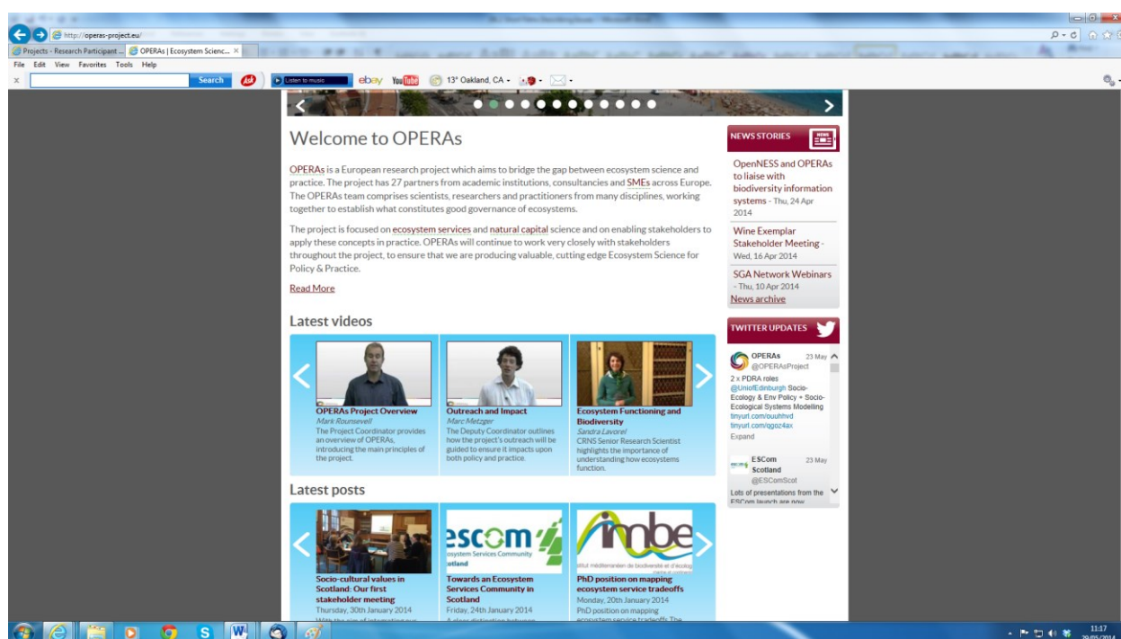
Figure 2: Screen Shot of OPERAs website with “Latest Videos”